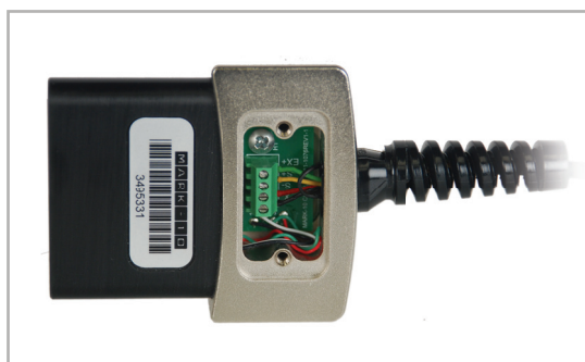
^ Cover is removed to expose the PCB with labelled wire connections and screw terminal block.

* The PTA adapter cannot be configured using older indicator versions. The PTA adapter can be used with older indicator versions, however, the adapter cannot be calibrated for single-direction load cells, such as load button and thru hole type load cells.