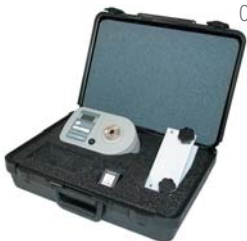
Optional carrying case