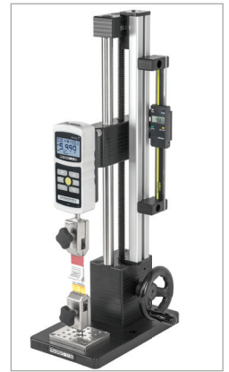
▲ Shown with an ES30 test stand and G1008 film & paper grips

Series 7 force gauges are directly compatible with Mark-10 motorized test stands, to permit functions such as break testing, tensile testing, compression testing, dynamic load holding, PC control capability, and many other applications.