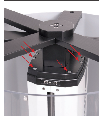
Fig. 1 Attaching the shield assembly to the ESM303 test stand column

With prior firmware versions, the FollowMe™ function will not operate while the door is open, however, the Auto Return function can still be used to return the crosshead to the home position automatically. Contact Mark-10 for upgrade instructions. For further instructions refer to the ESM303 user’s guide.