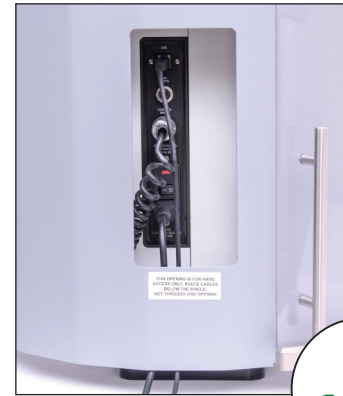
Fig. 3 Proper cable routing