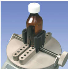
^ Optional flat jaws