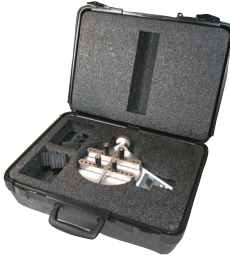
^ Optional carrying case