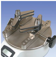
^ Optional adjustable jaws