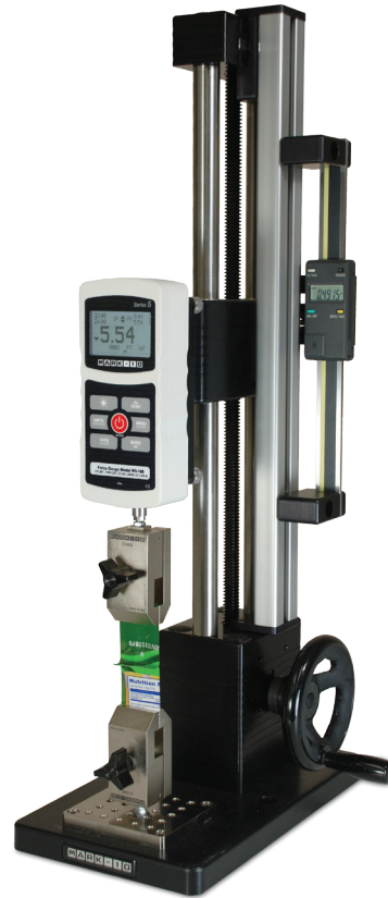
The ES30 is shown in a typical peel testing application, with Series 5 digital force gauge, digital travel display, and film & paper grips.