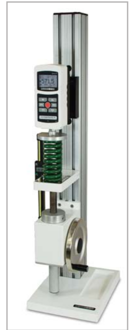
Shown with a TSF test stand in a spring testing application

The gauge include MESUR™ Lite data acquisition software. MESUR™ Lite tabulates continuous or single point data. Data saved in the gauge's memory can also be downloaded in bulk. One-click export to Excel easily allows for further data manipulation.