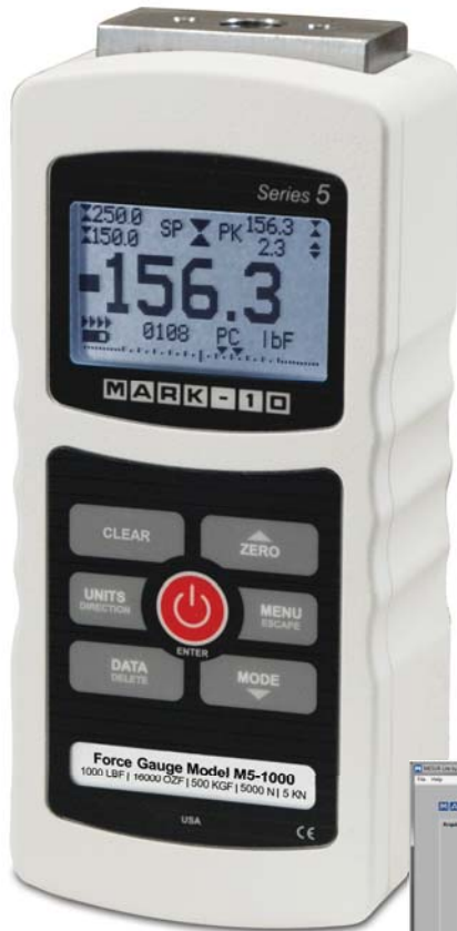
MESUR™ Lite data acquisition software is included with the gauges