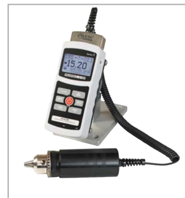
5i is shown mounted to an optional AC1008 tabletop stand with Series R50 torque sensor

The 5i includes MESUR™ Lite data acquisition software. MESUR™ Lite tabulates continuous or single point data. Data saved in the indicator's memory can also be downloaded in bulk. One-click export to Excel easily allows for further data manipulation.