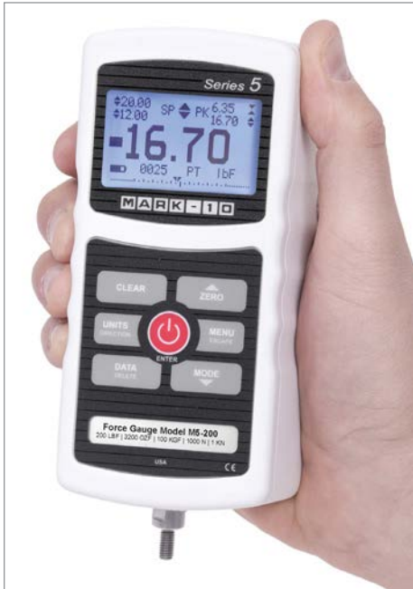
Force gauge displays real time force reading, peak force, and pass/fail indicators. The load cell shaft may be oriented in the up or down position, as demonstrated in the images below.