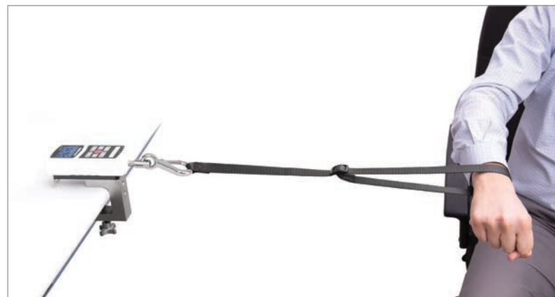
Force gauge shown in a horizontal orientation