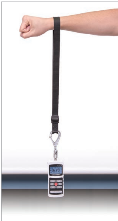
Force gauge shown in a vertical orientation

The Model EKM5-200 Myometer Kit facilitates a wide range of strength assessments and ergonomics studies. Featuring a Series 5 force gauge with 200 lbF (1,000 N) range, tabletop mount, strap, and accessories, this kit is ideal for ergonomists and other professionals.