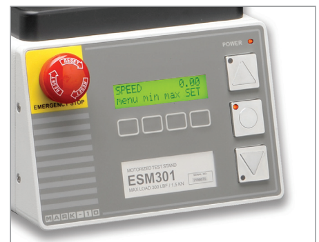
^ Digital controller features a backlit LCD screen with menu choices for ease of setup and operation

Facilitates safe mounting to a work bench. Consists of a set of mounting adapters, and four sets of hardware with Allen key to accommodate surfaces of various thickness. Recommended when ordering column extensions.