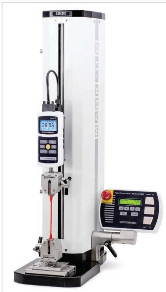
^ ESM303 is shown above configured for a tensile test, with a Series 7 force gauge and G1061-2 wedge grips.

The ESM303 is a highly configurable single-column force tester for tension and compression measurement applications up to 300 lbf [1.5 kN], with a rugged design suitable for laboratory and production environments. Sample setup and fine positioning are a breeze with available FollowMe™ force-based positioning - using your hand as your guide, push and pull on the force gauge or load cell to move the crosshead at a variable rate of speed.