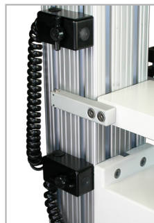
^ Included set of adjustable limit switches