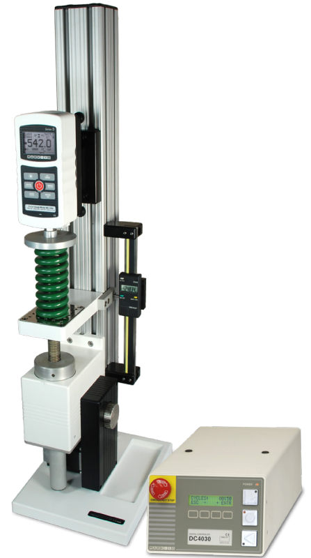
The TSFM500-DC is shown in a typical spring testing application, with Model M5-1000 digital force gauge and compression plate.