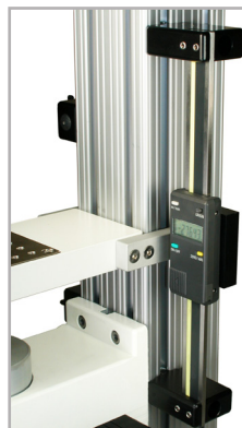
^ Optional digital travel display