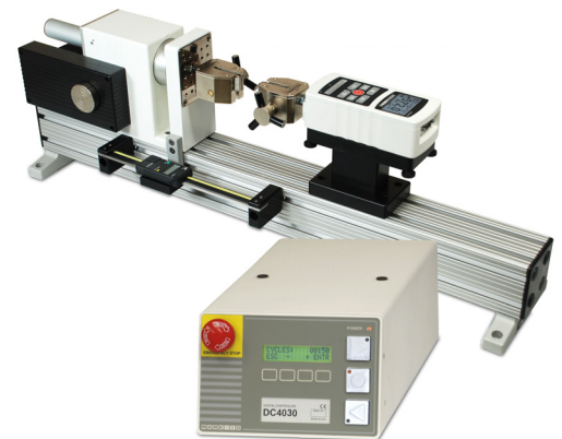
The TSFM500H-DC is shown configured for a tensile test, with Model M5-1000 digital force gauge and wedge grips.