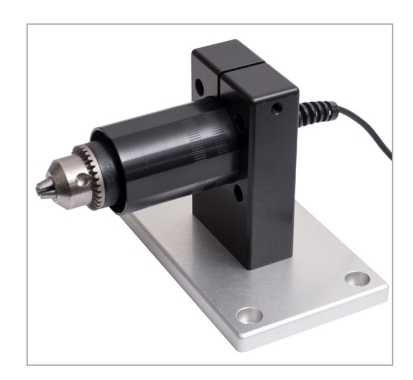
AC1007 Tabletop stand for sensor

Conveniently positions the indicator for easy viewing. Includes thumb screws to for indicator installation and thru holes for bench mounting.