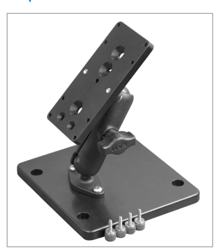
AC1100 Tabletop stand for indicator

Conveniently positions the indicator for easy viewing. Includes thumb screws to for indicator installation and thru holes for bench mounting.