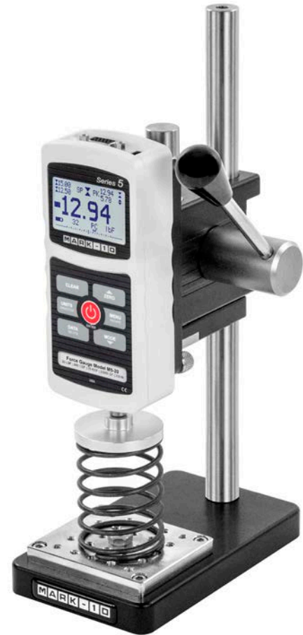
The ES05 is shown in a spring compression test, with Series 5 digital force gauge and 2" compression plate

Base plate AC1060 Contains 25 #10-32 threaded holes for fixture mounting