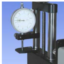
Dial travel indicator