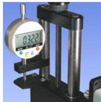
Digital travel indicator