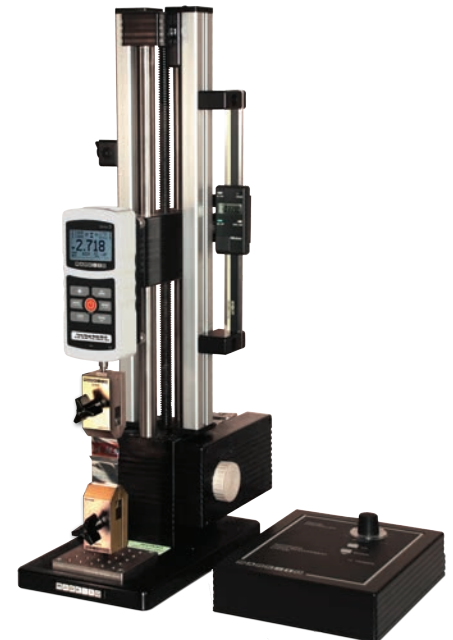
The ESM is shown in a typical tensile testing application, with Series 5 digital force gauge, digital travel display, limit switch kit, and wedge grips