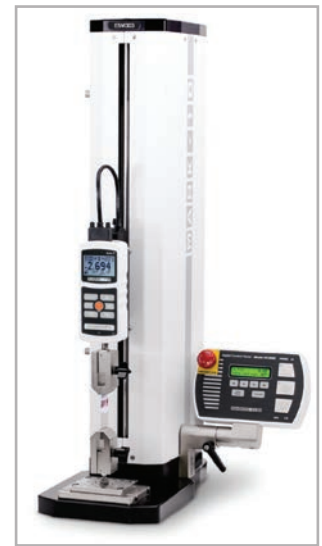
Shown with an ESM303 test stand and G1008 film & paper grips

accurate. An ergonomic, reversible aluminum design allows for hand held use or test stand mounting for more sophisticated testing requirements. Series 5 force gauges are directly compatible with Mark-10 test stands, grips, and software.