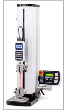
Shown with an ESM303 test stand and G1061 wedge grips

Series 7 force gauges are directly compatible with Mark-10 motorized test stands, to permit functions such as break testing, tensile testing, compression testing, dynamic load holding, PC control capability, and many other applications.