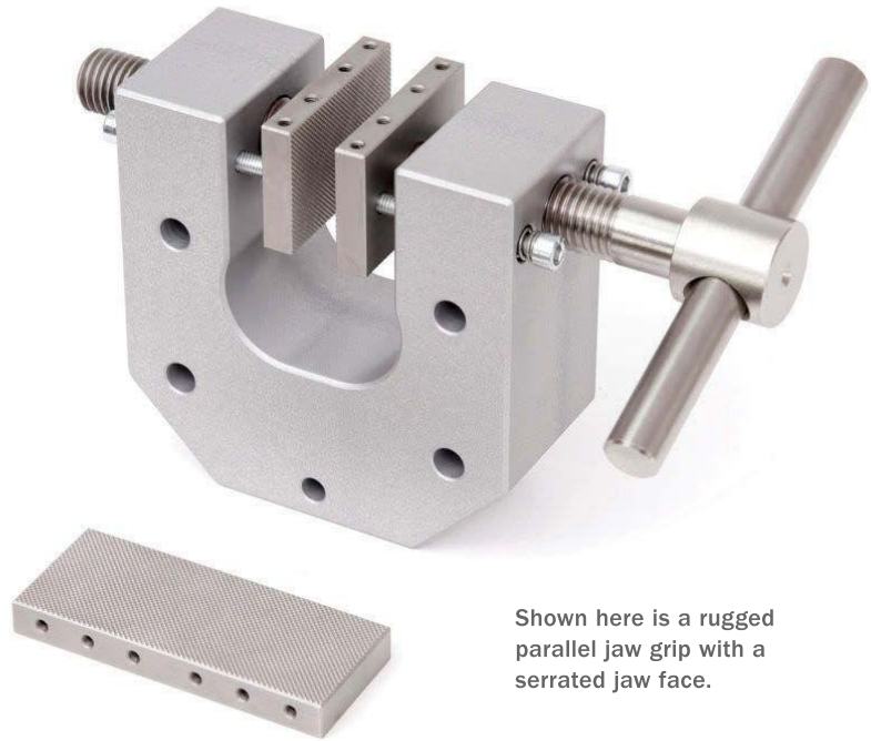
Shown here is a rugged parallel jaw grip with a serrated jaw face.

Specialized grips for film or paper can have interlocking jaws to secure