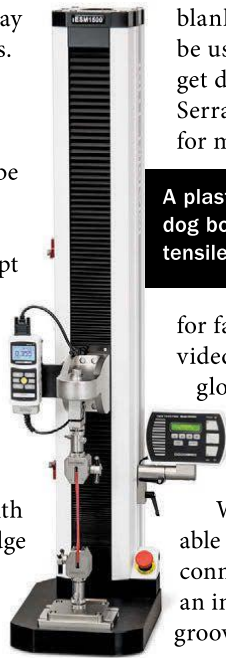
A plastic dog bone tensile test

Plastic dog bones, composites and metals can be tested with wedge grips. Spring-loaded wedge grips work by gripping a material continuously while it thins out as it elongates. The downside is that as the sample thins, the grip automatically tightens further, which will affect the distance measurement. This is not a problem for applications not requiring distance measurement. For force-distance measurements (or stress-strain), parallel jaw grips are a better choice. They do not self-tighten like wedge grips, but are an easy-to-use solution.