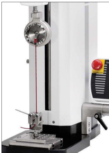
Wire terminal testing is a popular tensile test application.