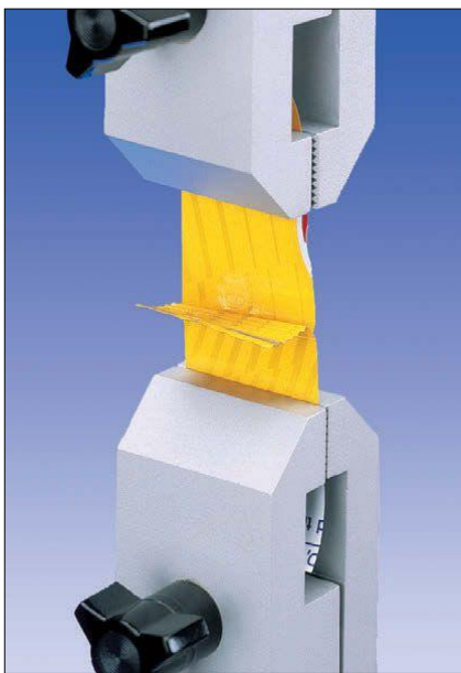
An example of peel testing with manual grips

To perform a tensile test, insert a sample of a material between two fixtures